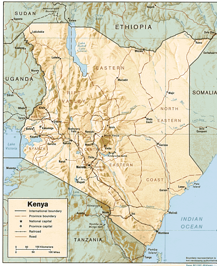
Figure 1. 1: Location of Kenya and Provincial Administrative units

Location: The Republic of Kenya is situated on the East African coast on the equator. It is bordered by Ethiopia and Sudan to the north, the Indian Ocean and Somalia to the east, the United Republic of Tanzania to the south, and Uganda and Lake Victoria to the west. The total area of the country is 580,370 square kilometres (km 2 ). The country is subdivided into eight provinces for administrative purposes as shown in Fig. 1.1.